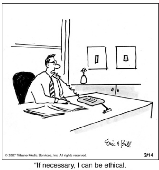
Fortunately, it hasn't come to that."