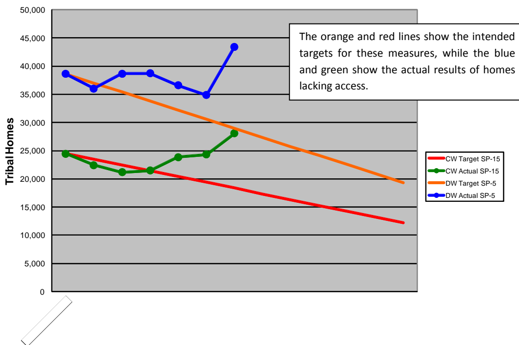
Chart 1. Number of Tribal Homes that Lack Access to Safe Drinking Water and Wastewater Services